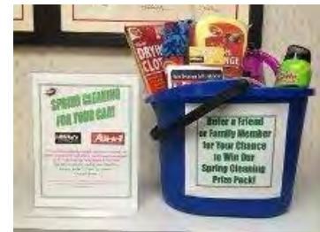
Pictured: Spring Cleaning Prize Pack

Be sure to refer your friends and family to us by June 30th to be entered into our BBQ Basket drawing! The winner will be chosen by random selection during the first week of July.